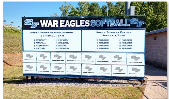
Bullpen Roster Board - 18" x 24" ($100/$200 Eagles Nest Supporters)

Please Make Checks Payable to: SFHS Softball Booster Association, Inc.