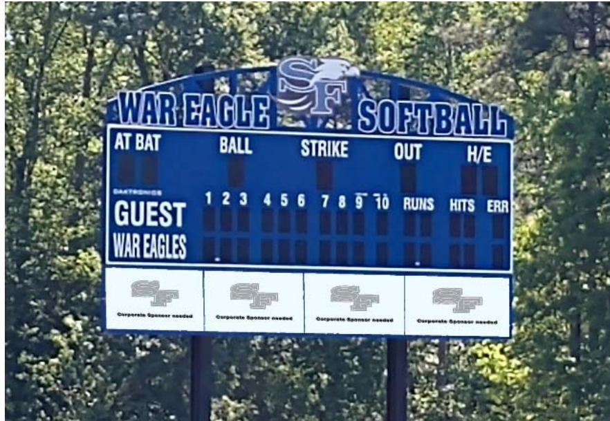
Centerfield Scoreboard - 36" x 60" (Platinum Sponsors)