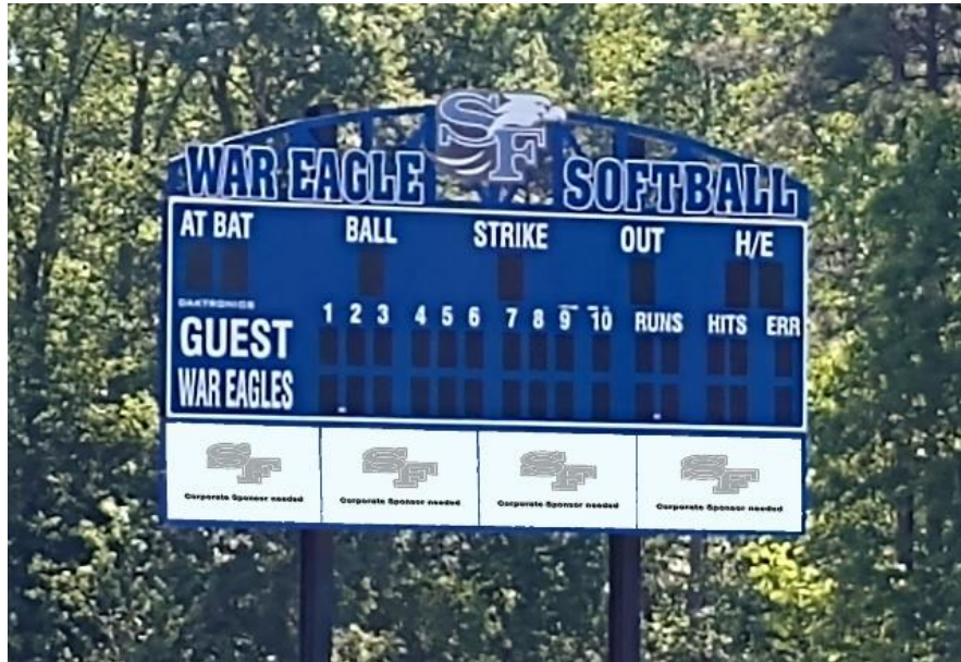
Centerfield Scoreboard - 36" x 60" (Platinum Sponsors)